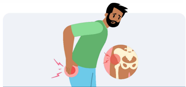
Intense and long-lasting bone pain