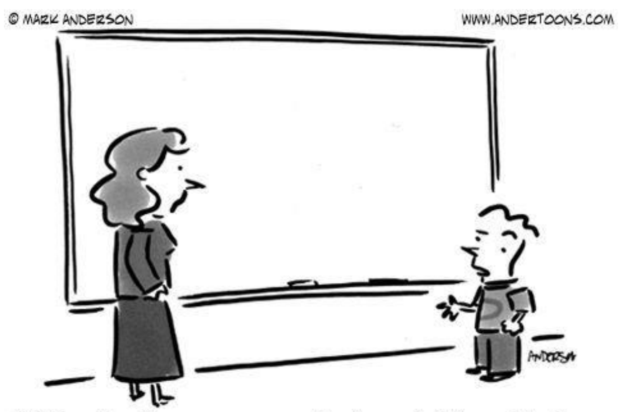
"Before I write my name on the board, I'll need to know how you're planning to use that data."